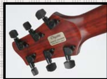
■ Ebony tuner buttons feel, yep, organic