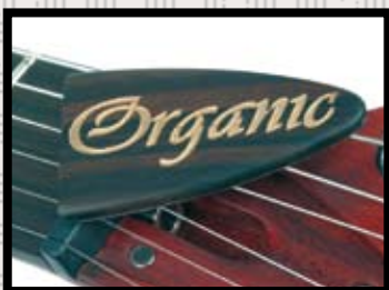
■ It's magnetic. How cool is that?

PUT SIMPLY: STUNNING. A BRIGHT FUTURE SURELY BECKONS FOR ORGANIC