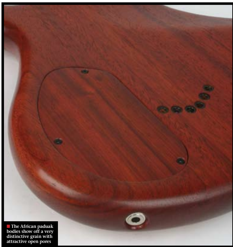
■ The African paduak bodies show off a very distinctive grain with attractive open pores

You can always tell a good electric guitar by a couple of different factors, not the least of which is the quality of the acoustic tone. The natural wood body, virtually free as it is from layer-upon-layer of suffocating lacquer, vibrates like a goodie bag at an Ann Summers party, and both guitars have a genuinely powerful and rich acoustic voice that resonates with a very impressive amount of sustain.