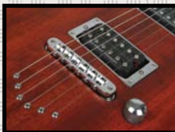
■ Schaller Nashville tune-o-matic-style bridge