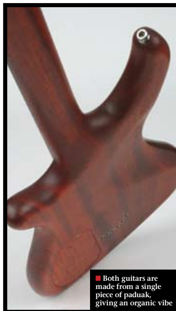
■ Both guitars are made from a single piece of paduak, giving an organic vibe

Plugged into an old Fender Pro Reverb amp with a Keeley modified TS 808 Tube Screamer overdrive pedal to help goose-up the front end, the Standard has a bold authoritative voice with a sweet-sounding edge. The