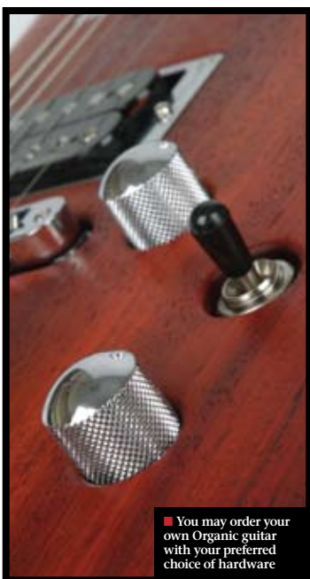
■ You may order your own Organic guitar with your preferred choice of hardware